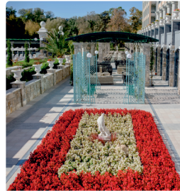
The spacious garden of Astor Garden Hotel