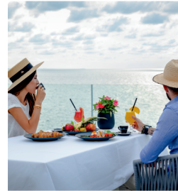
Outdoor terrace in restaurant Villa Chinka