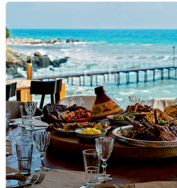
The Bay - Where the Sky Kisses the Sea