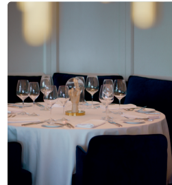
Monty restaurant in Center Primorski